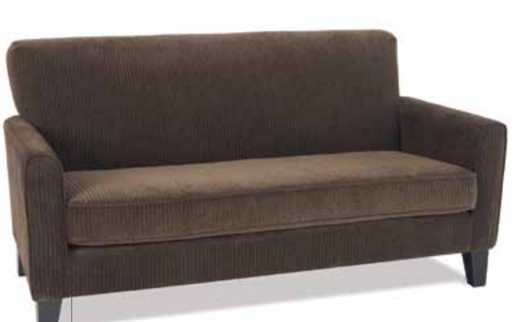
Sierra Loveseat SRA52 Dimensions: 65" x 34.5" x 34.5" H Available Color: Corduroy Coffee -C47

Sierra Chair SRA51 Dimensions: 31.5" x 34.5" x 34.5" H Available Color: Corduroy Coffee -C47