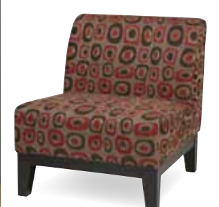
Twilight Red -T11