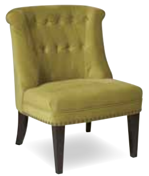
Brushed Basil -B16