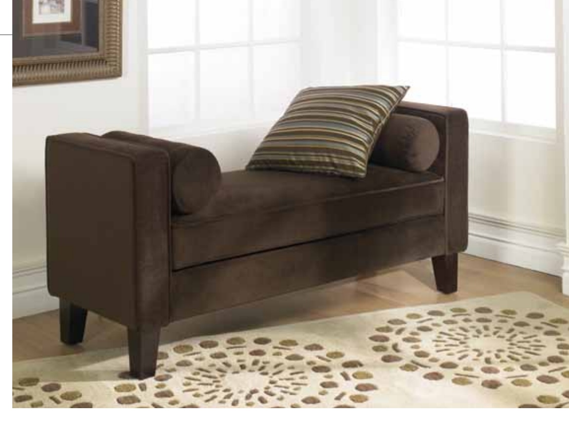
Curves Bench W/ 2 Bolsters CVS20 Dimensions: 54.5" x 21" x 25" H Available Color: Chocolate Velvet -C12

The Curves Bench features 2 bolster pillows while the Estrella Storage Bench opens for storage and is adorned with antique nail heads.