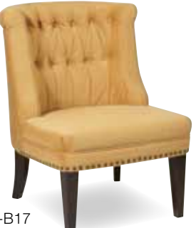
Brushed Butternut -B17