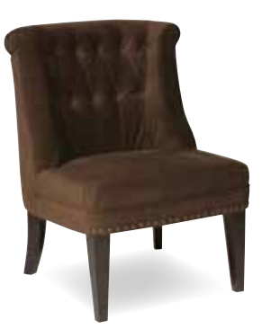
Brushed Chocolate -B14

VEN Dimensions: 27.25" x 28.25" x 33.75" H Available Colors: Brushed Chocolate -B14, Brushed Oyster -B15, Brushed Basil -B16 or Brushed Butternut -B17