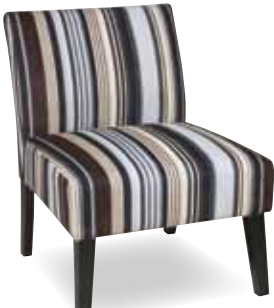
Stripe Sky -D04